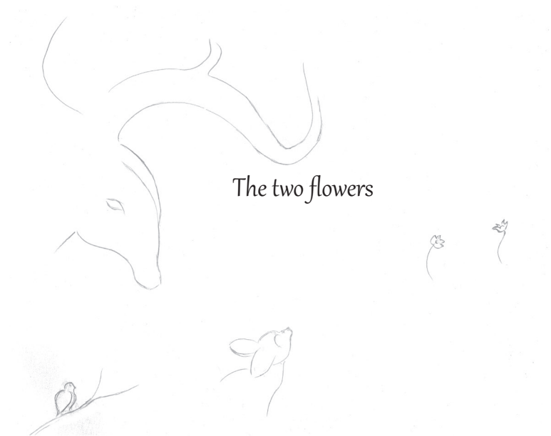
The two flowers